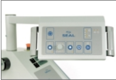
Ergonomic touch pad control panel on a swinging arm.