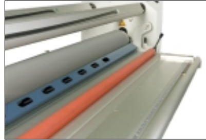
Feed table with built-in tensioning rollers and a flip down image guide.